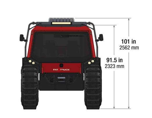
© 2023, ZEAL MOTOR INC., All right reserved.